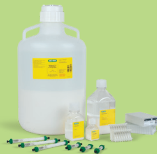
Process purification bottles, columns, and plates.