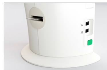
Fig. 2. Inserting the slide into the TC20 Cell Counter; counting automatically begins.