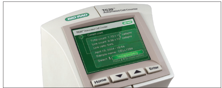
Fig. 3. Current count screen showing total cell count, live cell count, and percentage of live cells; cell viability is measured via trypan blue exclusion.

In the Dilution calculator, the current count is used as the starting cell concentration. The parameter that is ready to be modified is highlighted. Press the up or down arrow key to find the correct value, then press Enter to confirm the selection. To print the Dilution calculator screen, press the down arrow key and select Yes .